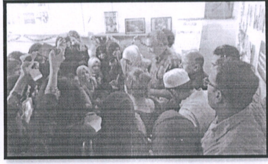
Authorities and staff celebrating women's day with female students