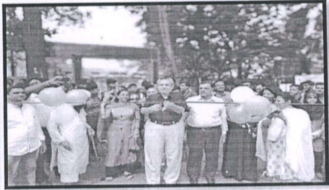
Inauguration of festival By Authority