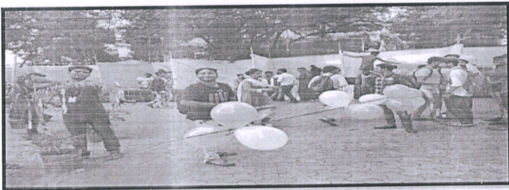
Students enjoying the campus and Food stalls

YUVAK-YUKTI MELA -With an objective to promote gender equality as a joint initiative of Maharashtra State Commission for Women & Akshara centre, the Internal Complaint Committee of our college organized “YUVAK-YUKTI MELA”,in the college campus on Saturday, 9th February 2019 from 10a.m. to 1p.m. for all section of college.To organize this programme in our college campus, 6 students of our college were sent for training on 15th January 2019 at Parish Hall, Portuges church, Dadar, West, where they were trained by Akshara Centre from 10am to 3.30pm. In the mela there were games stalls with the purpose to address gender issues through fun and interaction. The volunteers were in charges of stalls to entertain and educate the visitors .The first stall was with the theme WHO IS REAL MAN? The second stall was for RACE FOR EQUALITY. The Third stall was WHAT IS REAL BEAUTY? The fourth stall was ME-TOO CAMPAIGN. All visitors appreciated these innovative ways of educating students about gender equality. Formal feedback of Student’s was extremely great. They liked the concept of stalls with games to learn about gender issues.