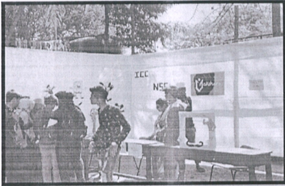
Students at selfie Point