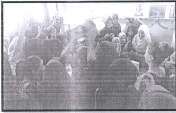
Students capturing the moments