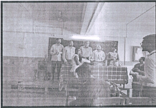
Jury with Authority

➤ Essay Competition By URDU CARVAN- On 14th February 2019, the essay competition on the topic "What Is Valentine Day-Your Opinion", was organized in different languages for degree students in association with URDU CARVAAN. The objective was to enlighten the students about real meaning of valentine and how to be celebrated as per our culture. Students participated and expressed their opinion by highlighting the pros and cons ,the way its celebrated today. Out of participated students, the team selected the best three essay and winners were given the prizes along with certificates.