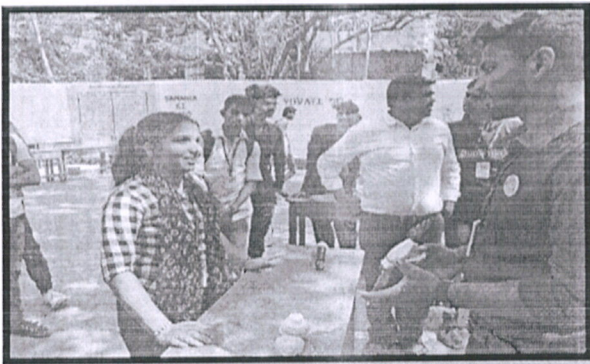
Students participating in event of mela