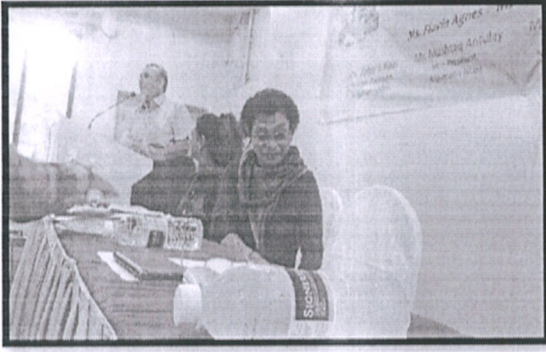
Audience addressed by the authority