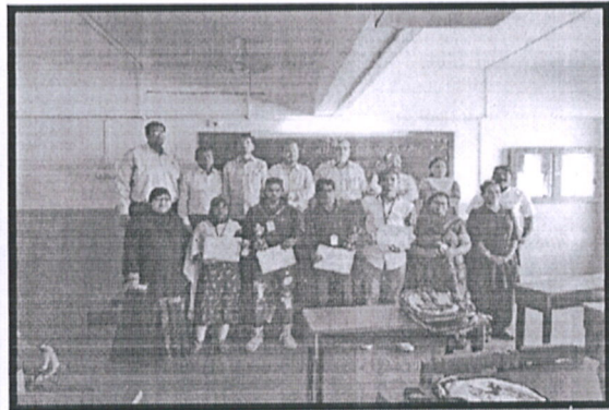
Winners of Essay

➤ Celebration of Women's Day- On 8th March, on eve of International Women's day, the female common room of students was decorated and along with authorities and staff, the day was celebrated. Students were asked to express their opinion about this day as well as they were given atmosphere to enjoy it along with refreshments.