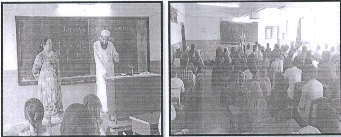
Members creating Awareness about ICC