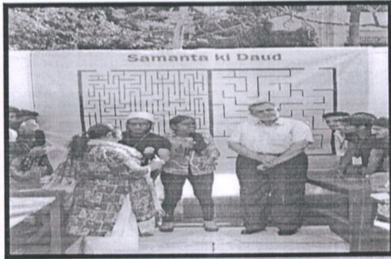
Authority interacting with students