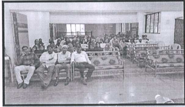
Audience at workshop

➤ Essay Competition By URDU CARVAN- On 14th February 2019, the essay competition on the topic "What Is Valentine Day-Your Opinion", was organized in different languages for degree students in association with URDU CARVAAN. The objective was to enlighten the students about real meaning of valentine and how to be celebrated as per our culture. Students participated and expressed their opinion by highlighting the pros and cons ,the way its celebrated today. Out of participated students, the team selected the best three essay and winners were given the prizes along with certificates.