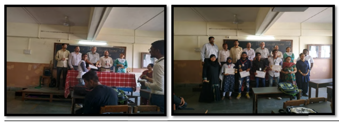
Jury with Authority

Essay Competition By URDU CARVAN- On 14th February 2019, the essay competition on the topic "What Is Valentine Day-Your Opinion", was organized in different languages for degree students in association with URDU CARVAAN. The objective was to enlighten the students about real meaning of valentine and how to be celebrated as per our culture. Students participated and expressed their opinion by highlighting the pros and cons ,the way its celebrated today. Out of participated students, the team selected the best three essay and winners were given the prizes along with certificates.