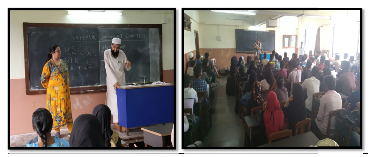
Members creating Awareness about ICC

Awareness Programme- To create awareness about Internal Complaint Committee, the program was kept for all classes of FYBCOM & SYBCOM. The members of the committee visited to all classes and in detail explained what comes under sexual harassment? Who can file complaint? What rights has ICC and its significance. Students were told that the main objective is to create fear free campus environment for all genders and to promote gender sensitization as well as to organize more female welfare oriented programmes. The students were informed about list of members along with their contact numbers.