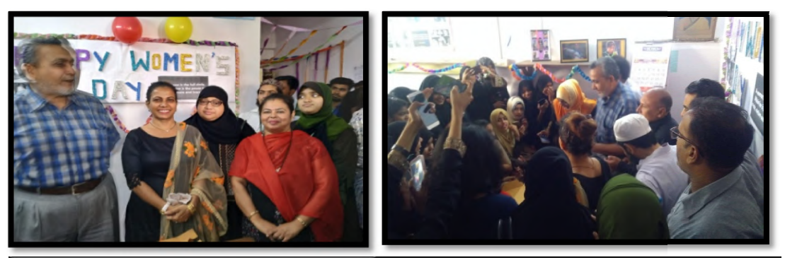
Authorities and staff celebrating women's day with female students