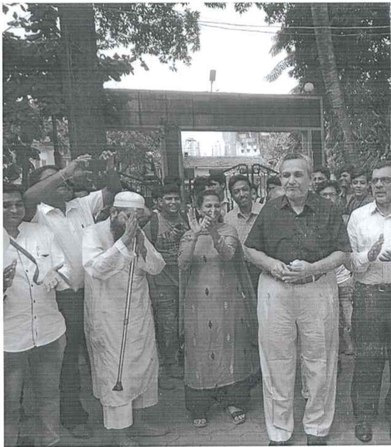
Yuvak Yuvati Mela 27/02/2020